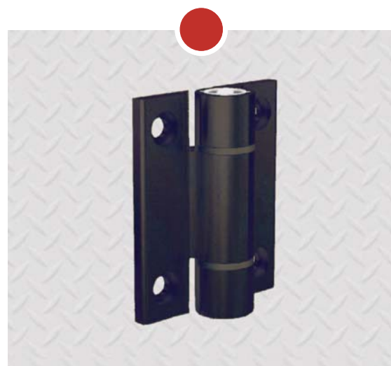
Black anodised aluminium profile spring hinge (available in 0,35 N.m, 0,70 N.m and 1,3 N.m)