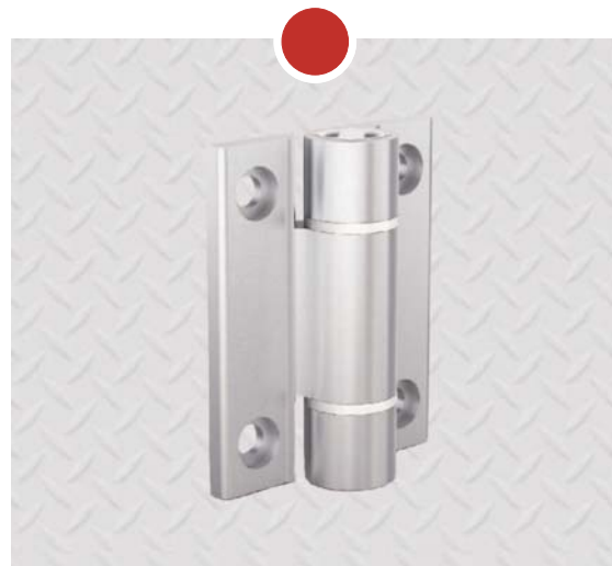
Clear anodised aluminium profile spring hinge (available in 0,35 N.m, 0,70 N.m and 1,3 N.m)